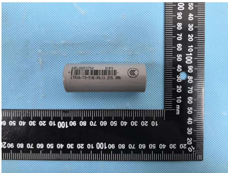
Photo 4 电池正面 Front view of Cell